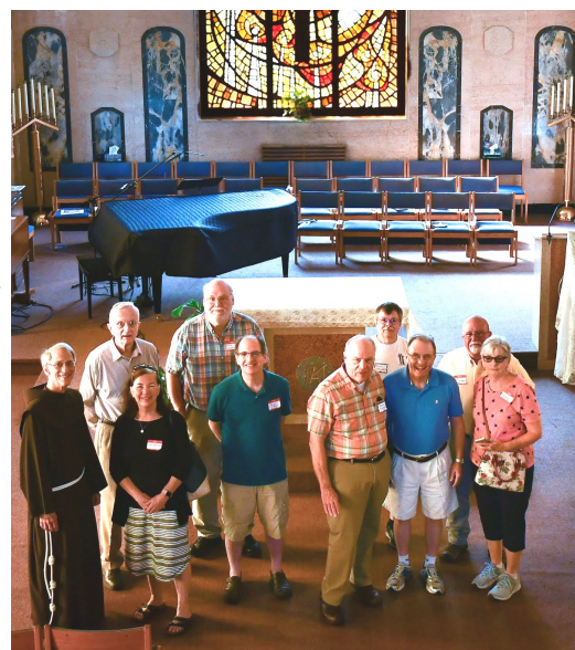
Alumni tour group at St. Moses the Black Friary