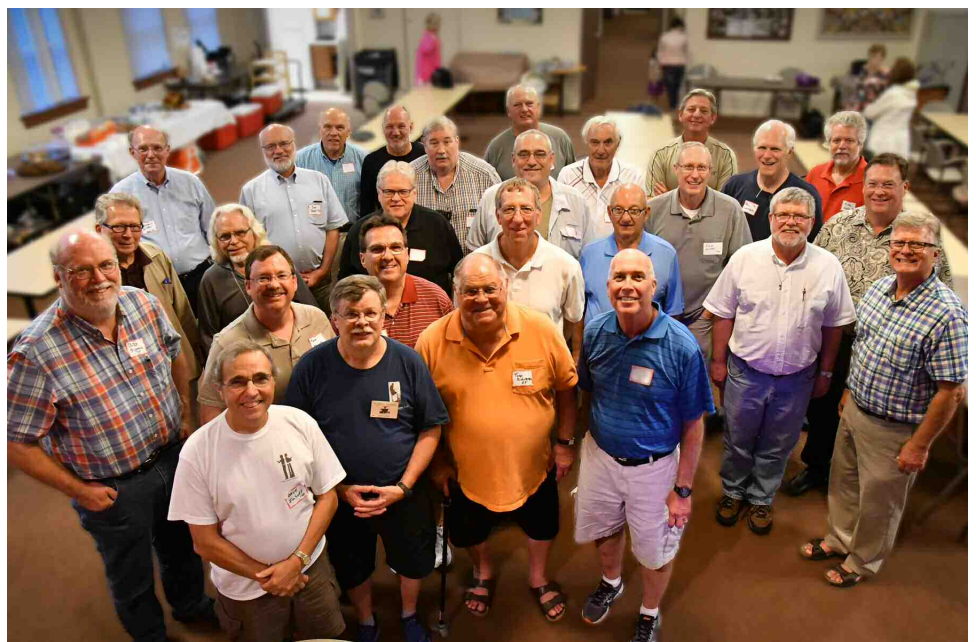
Right: Most of the Saturday night group