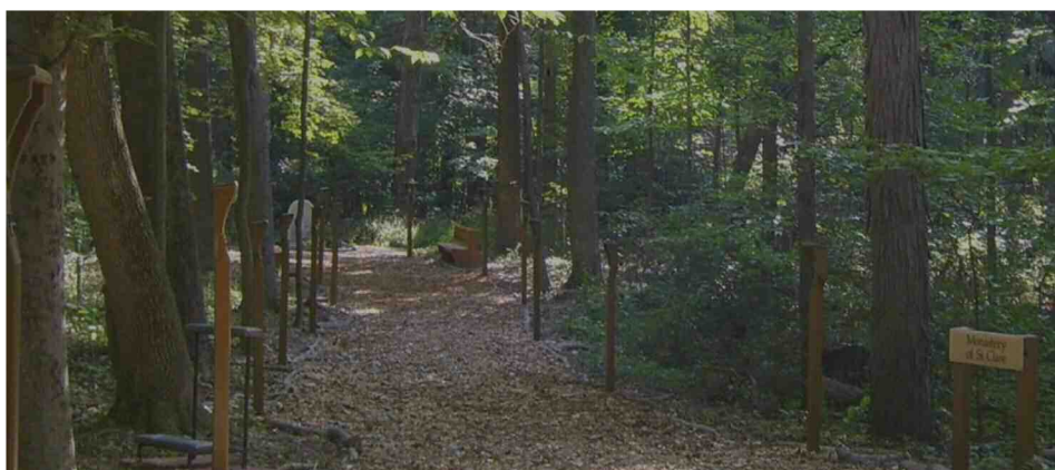
Stations of the Cross at Franciscan Monastery of St. Clare

9-9:25 am: Arrive (please try to carpool from the seminary parking lot because there is very little room in the Clare's' parking lot; or park at the former SFS and walk through the woods across the stone bridge and up the hill...)