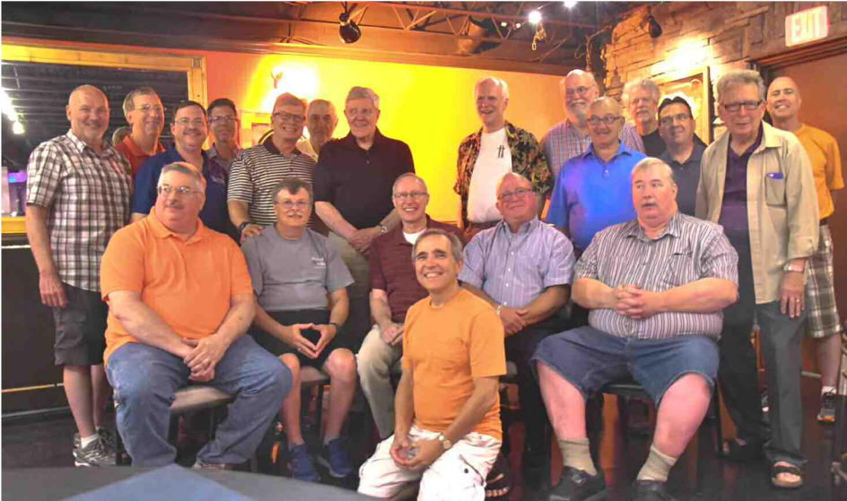
Thursday night at The Public House

We tried a new format for the 2017 Reunion that included ample opportunities for interacting with alumni and former teachers, as well as a mini-retreat on Saturday morning. The result was a very entertaining and spiritual weekend.