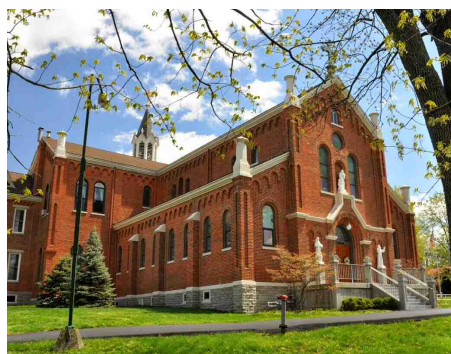
St. Anthony Shrine/Friary

profit organizations work together to serve basic needs of the impoverished and the homeless in one location.