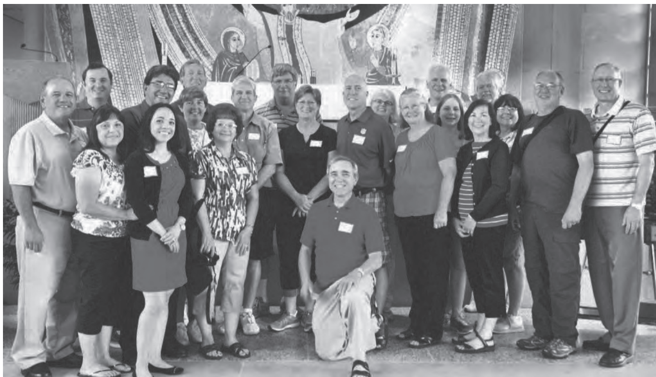
Alumni at Blessed John Paul II Shrine