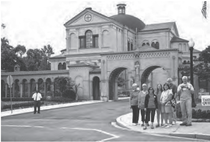
Franciscan Monastery of the Holy Land, Washington DC